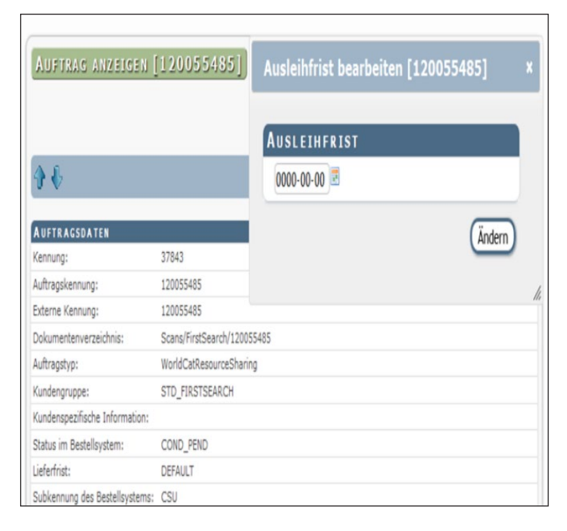
Template to change the loan period

via individually configurable batch runs from My-Bib eDoc® and released into the workflow.