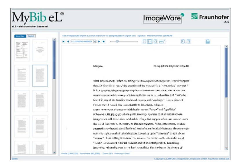
Example of a document provided in MyBib eL®

Since the beginning of 2014, the SUB Goettingen handles all interlibrary loans comfortably and as far as possible automatically via MyBib eDoc<sup>®</sup>. Associated automation and standardization of work processes and workflows have made the relief of personnel possible, which can now be deployed to further improve the services of the SUB Goettingen.