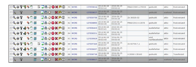
Excerpt from the overview of received orders