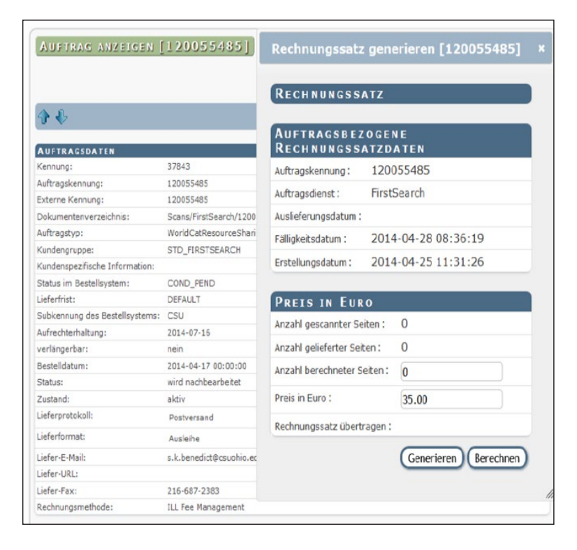
Template to change the interlibrary loan prices