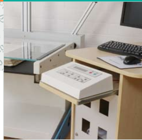
User panel for scanner